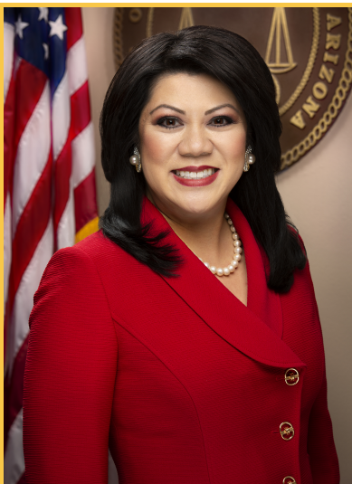
ARIZONA TREASURER KIMBERLY YEE

Treasurer Yee is the first Asian American elected to a statewide office in Arizona's history. She is also the first Chinese American Republican woman to win a major statewide office in United States history. Kimberly Yee was elected to the Arizona Legislature in 2010 and served as the Senate Majority Leader. Kimberly was the second woman elected as Senate Majority Leader in Arizona's history, following U.S. Justice Sandra Day O'Connor who served in the position in 1973. With eight years of experience in the Arizona Legislature, as well as four years working for the Arizona State Treasurer's Office, Treasurer Yee brings a unique perspective to this important financial leadership role for Arizona.